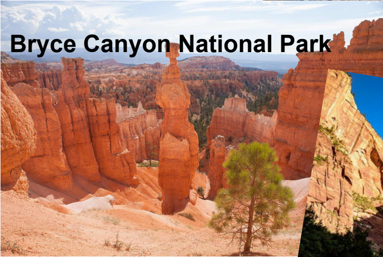
Bryce Canyon National Park